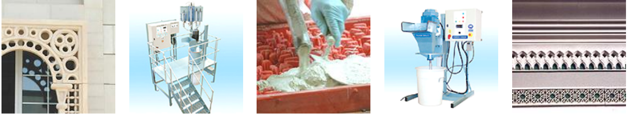
A=Alkali Resistant CS=Chopped Strand 19=Chopped Length H950=Sizing X=200 Filaments

ACS19PH950X is formed from 200no. 18-micron diameter filaments. It has the highest strand integrity and high fibre percentages can be added without adversely affecting the workability. ACS19PH950X is resistant to overmixing.